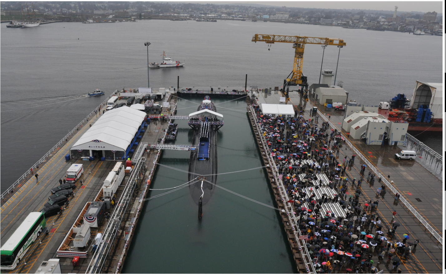
U.S.S. Missouri—SSN-780 in basin for her Christening. A 75 foot Coast Guard Cutter is patrolling the Thames River and the USCGC Eagle—Nazi War Booty is tied up at the Coast Guard Academy Wharf. The Eagle, now WIX-327, was originally built as the Horst Wessel for the Kriegsmarine.